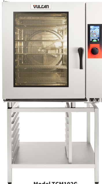
Model TCM102G Shown on optional stand